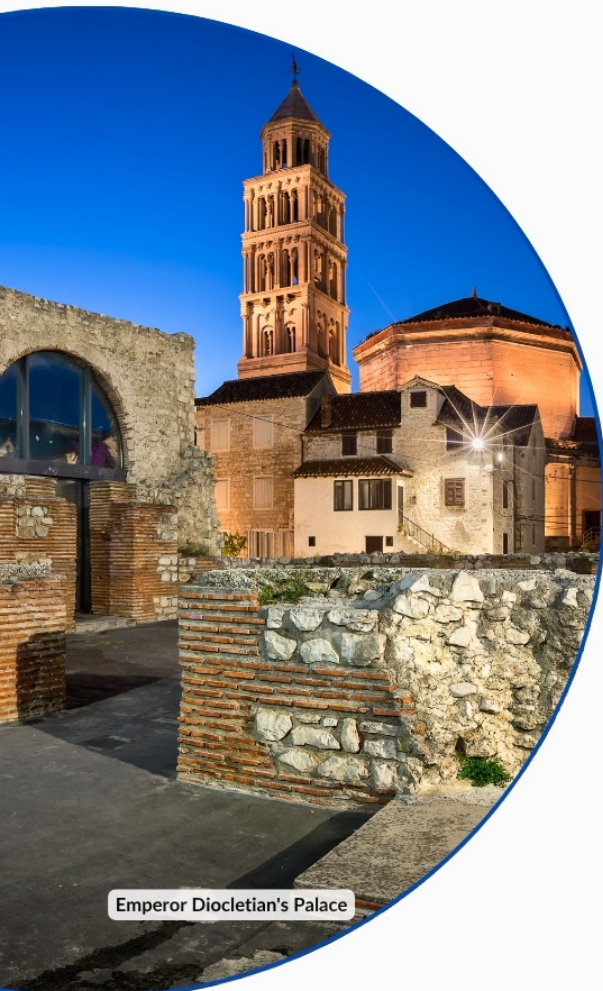
Emperor Diocletian's Palace