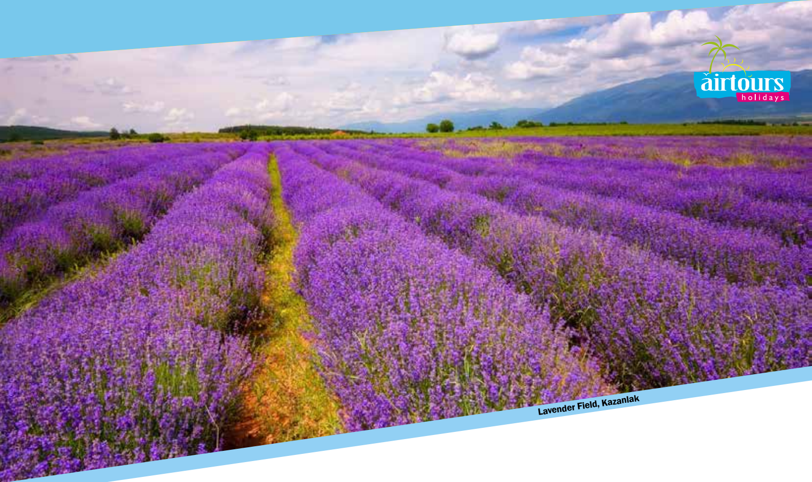
Lavender Field, Kazanlak