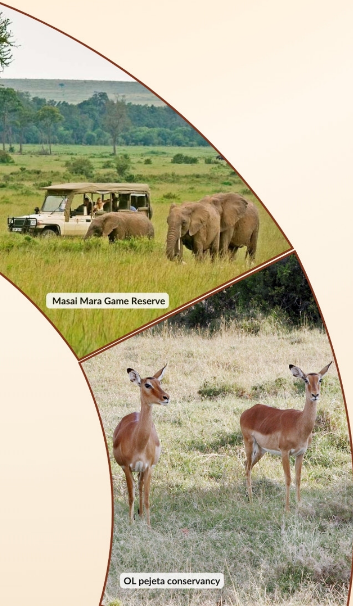
Masai Mara Game Reserve