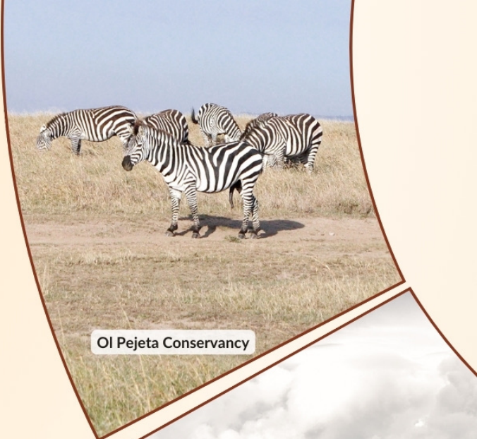
Ol Pejeta Conservancy