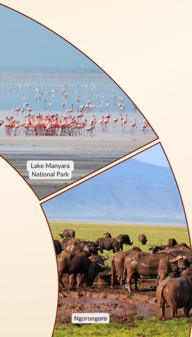
Lake Manyara National Park