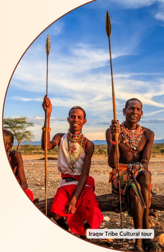
Iraqw Tribe Cultural tour